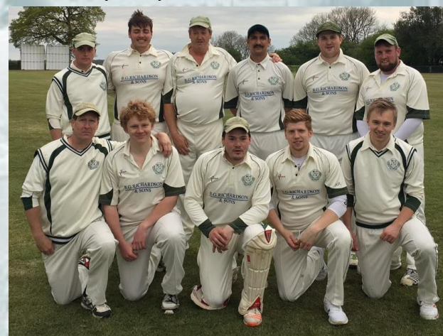
Successful Bledlow XI vs Bledlow Ridge

The Ridge finishing on 119 and a solid win against the local rivals starts off what we hope to be a promising National Village Cup run. We meet Chenies and Latimer in the next round at home on Sunday May 14 th .